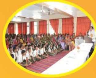
Multi purpose Hall